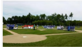
Little League baseball players at Hammon Field

In addition to its conservation land, Bridgton owns several types of open space, including general civic lands and parks.